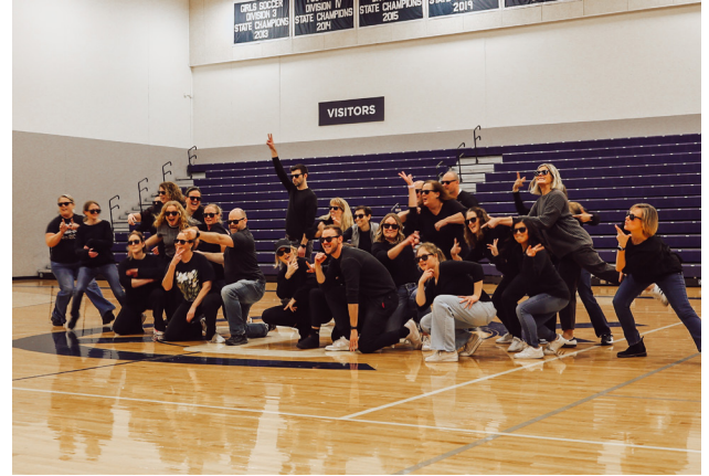
SCHS Staff Just Want to Have Fun! Several members of the SCHS staff surprised the students with a choreographed lip-sync during WinterFest.