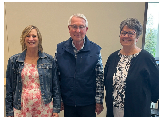
Retirement Open House